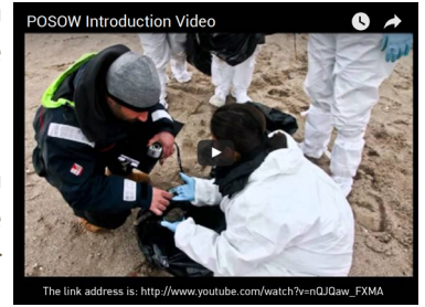
The link address is: http://www.youtube.com/watch?v=nQJGaw_FXMA

A new video of presentation and promotion of POSOW (I & II) produced by ISPRA can be watched on the project website.