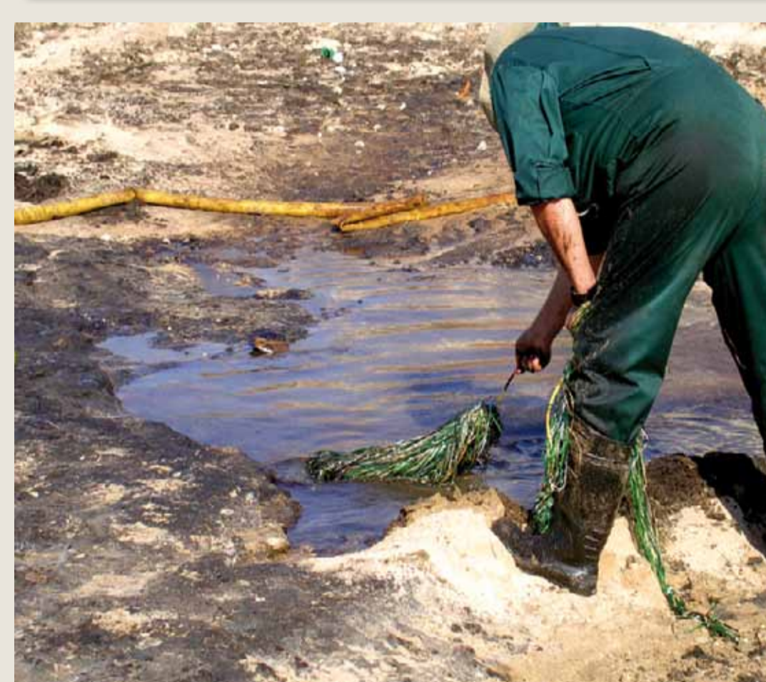
Use of sorbents