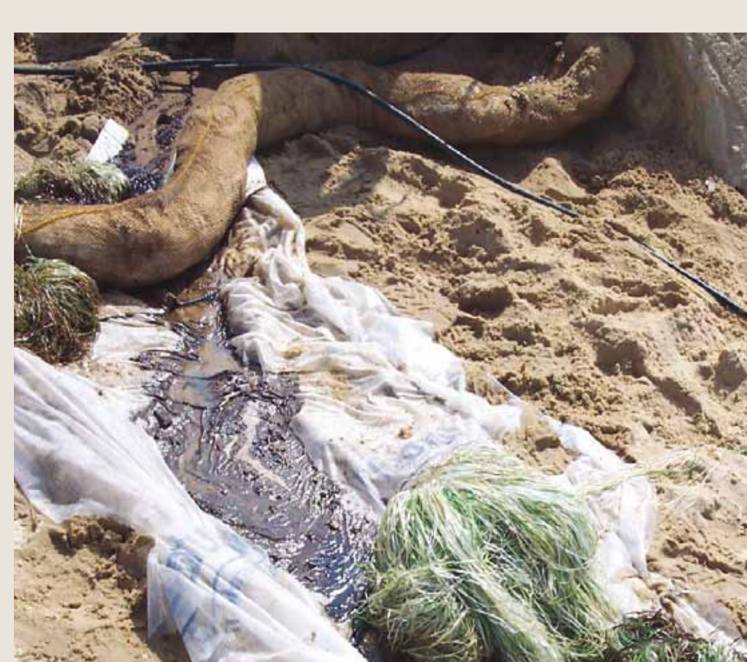
Sorbents / filtration