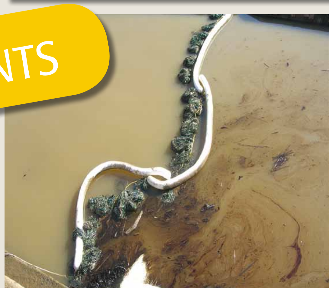
Sorbents / boom