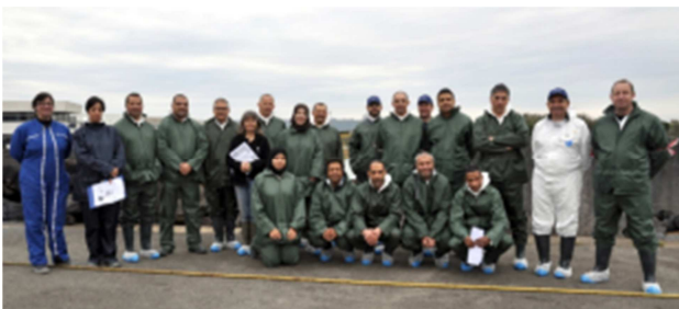
Train the trainer course n°1

A total of 32 trainers from the 7 targeted countries (Algeria (5), Egypt (4), Lebanon (6), Libya (1), Morocco (4), Tunisia (6), Turkey (6) and 2 trainers from Portugal were trained. Each country was provided with a set of training material in local language to duplicate the training courses.