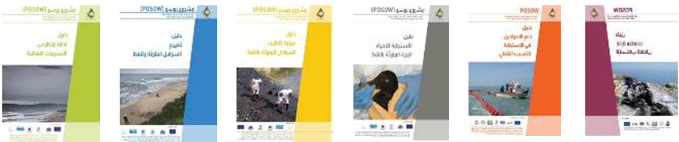
Arabic version of the 6 POSOW manuals