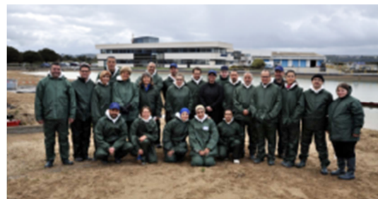
Train the trainer course n°2