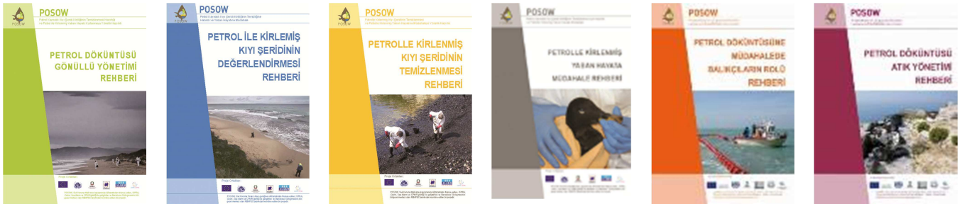
Turkish version of the 6 POSOW manuals

All the training material developed during POSOW I and POSOW II were translated into Arabic and Turkish. The six manuals, sixteen posters, seventeen Power-Point presentations and six Instructor manuals are available on the posow website.