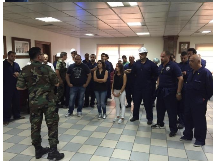
Training Room Exercise Briefing