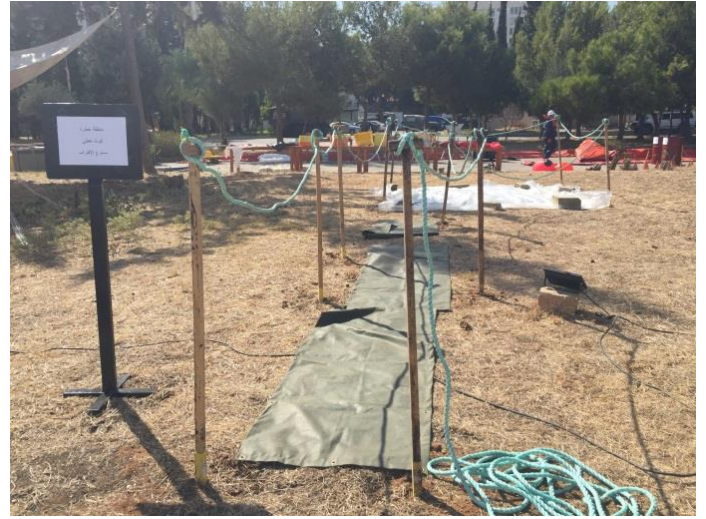
Worksite developed for the Practical session