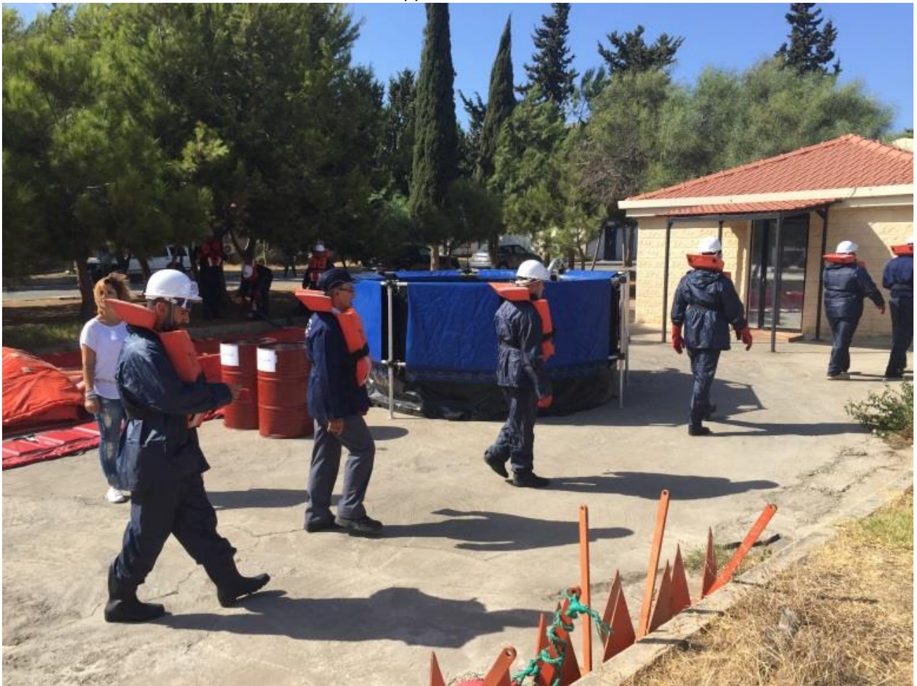
Towards the Off shore Exercise