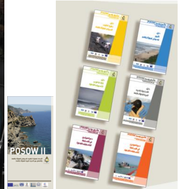
Project Training material in Arabic