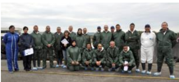
Train the trainer course n°1

A total of 32 trainers from the 7 targeted countries (Algeria (5), Egypt (4), Lebanon (6), Libya (1), Morocco (4), Tunisia (6), Turkey (6) and 2 trainers from Portugal were trained. Each country was provided with a set of training material in local language to duplicate the training courses.