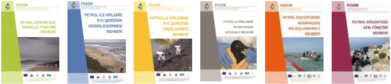
Turkish version of the 6 POSOW manuals

All the training material developed during POSOW I and POSOW II were translated In Arabic and Turkish. The six manuals, sixteen posters, seventeen Power-Point presentations and six Instructor manuals are available on the posow website.