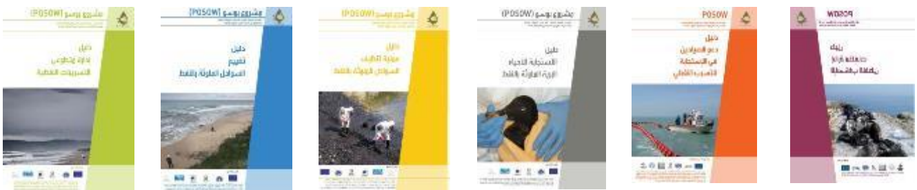
Arabic version of the 6 POSOW manuals