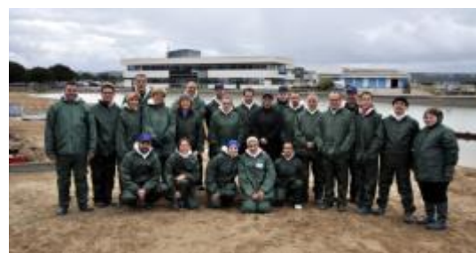
Train the trainer course n°2