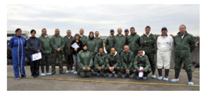
Train the trainer course n°1

A total of 32 trainers from the 7 targeted countries (Algeria (5), Egypt (4), Lebanon (6), Libya (1), Morocco (4), Tunisia (6), Turkey (6) and 2 trainers from Portugal were trained. Each country was provided with a set of training material in local language to duplicate the training courses.