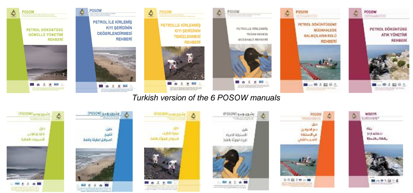
Arabic version of the 6 POSOW manuals

All the training material developed during POSOW I and POSOW II were translated into Arabic and Turkish. The six manuals, sixteen posters, seventeen Power-Point presentations and six Instructor manuals are available on the posow website.